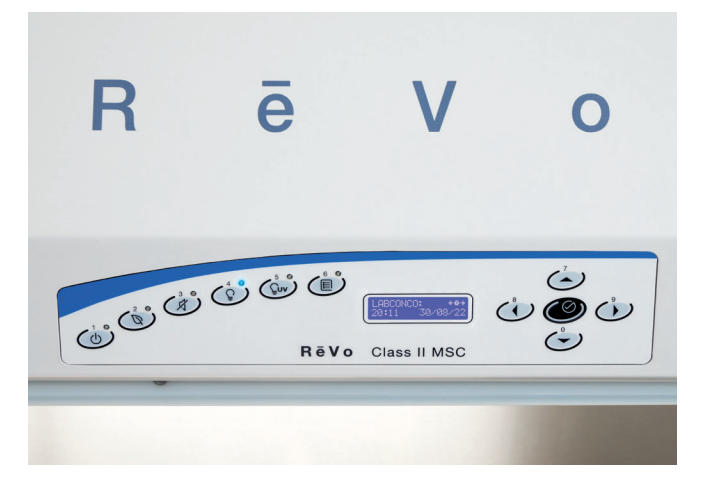
Intelligent Controls The advanced ReVo OS is intuitive and informative. Clear operation plus alert & alarm notifications keep users safe at all times.