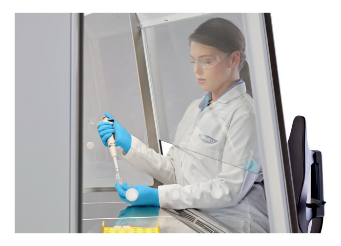
Full Side Windows ReVo cabinets provide the highest level of visibility, ensuring technician comfort while maintaining an open lab environment.