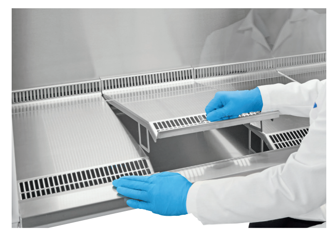
Multi-Piece Work Surface The ReVo's contaminationreducing work surface segments are easy to disinfect. Each 300 mm section is removable and interchangeable with a series of alternate work surfaces.