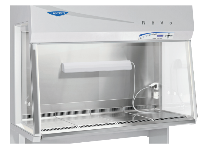
R3858500 – Ultraviolet Lamp Kit. Magnetically attaches to rear wall of ReVo and ReVo Pro cabinets for secondary cabinet disinfection. Includes 254 nm UV lamp with power cord. Installation required.