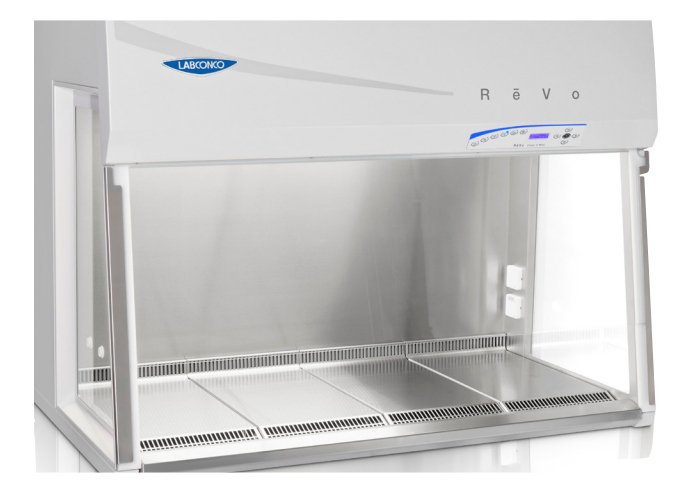
Flexible Design ReVo cabinets may be externally vented for applications involving chemical vapors or other hazards.