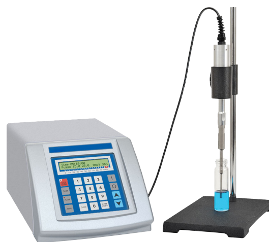
Stand sold separately.

The unit is effective for standard cell disruption, DNA/RNA shearing, homogenization and many other applications. The OM100 is ideal for small samples and for labs that do not plan to scale up to larger volumes in the future. This model offers the same programming and display features as the OM500 unit.