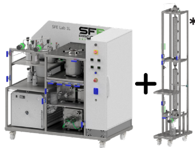
100 mL 500 mL 1+ 2+

Laboratory standard range from 100ml up to 2L