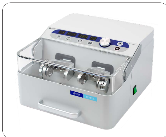
| Omni Bead Ruptor™ 96+

With identical processing capabilities to the BR96, the BR96+ is compatible with a variety of sample formats, including well plates and tubes, ensuring it remains a versatile choice for any laboratory. By utilizing the same accessories and consumables as the BR96, it provides seamless integration into your existing workflow.